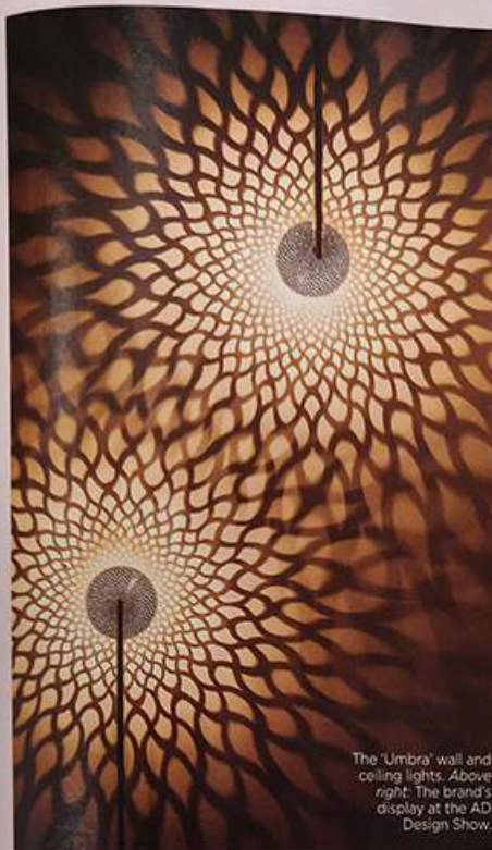
The 'Umbrā' wall and ceiling lights. Above right: The brand's display at the AD Design Show.