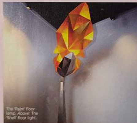
The 'Palm' floor lamp. Above: The 'Shell' floor light.

The brand has created a niche for itself with its repertoire of over 100 unique lighting products that seamlessly blend creativity and cutting-edge technology