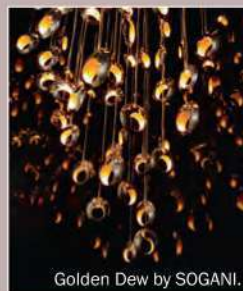
Golden Dew by SOGANI.