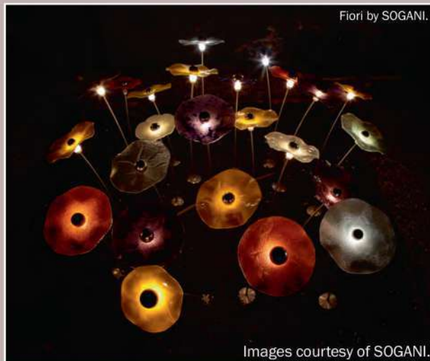
Flori by SOGANI.