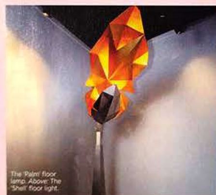
The 'Palm' floor lamp. Above: The 'Shell' floor light.

The brand has created a niche for itself with its repertoire of over 100 unique lighting products that seamlessly blend creativity and cutting-edge technology