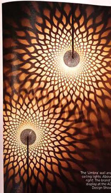
The 'Umbra' wall and ceiling lights. Above right: The brand's display at the AD Design Show.