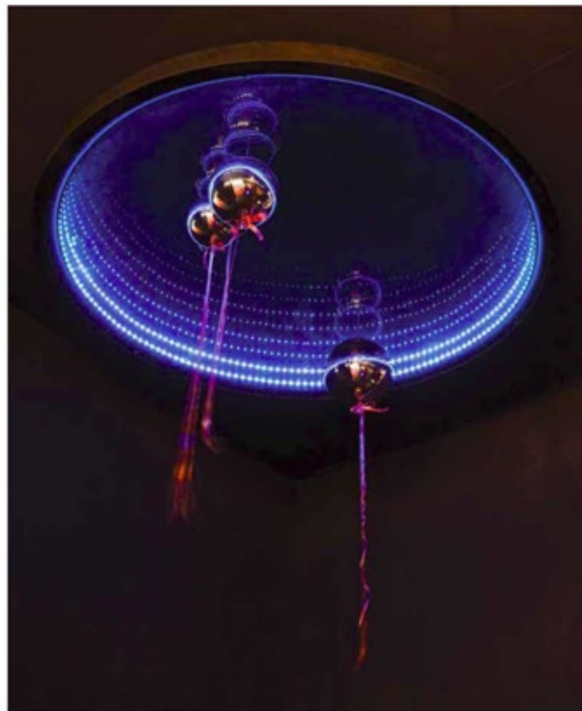
As the strings slip through our fingers, and we are no longer tied The balloons rise upwards, into the interminable sky

of planes cast a compendium of enchanting reflections, keeping the cryptic source of light concealed.